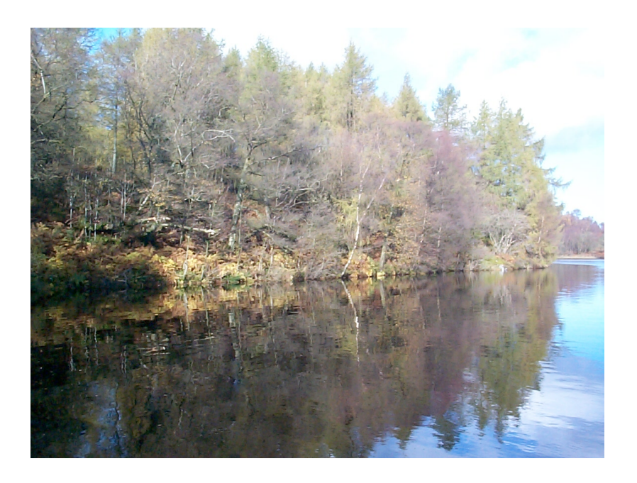
Sadly, we "see" nature, we smell "nature," we "taste, touch and hear" nature but we cannot be it, we process that information in parts, with very little way to actually be what we "see."

When I first got to the planet I could not understand the idea of "seeing" things. At a certain age, while not yet fully developed, the limitations of the senses were clear to me. I recall being very frustrated at having to "see" the mountains, trees, snow and textures of the Rocky Mountains. I could not accept that I could not be them, but had to "perceive" them through this isolation chamber known as my body. Seeing, hearing or tasting things in isolation is a form of separation and a far inferior way of existing relative to being something. Seeing things without the aid of perception is simply death, can you imagine looking at something with no way to actually make sense of it?