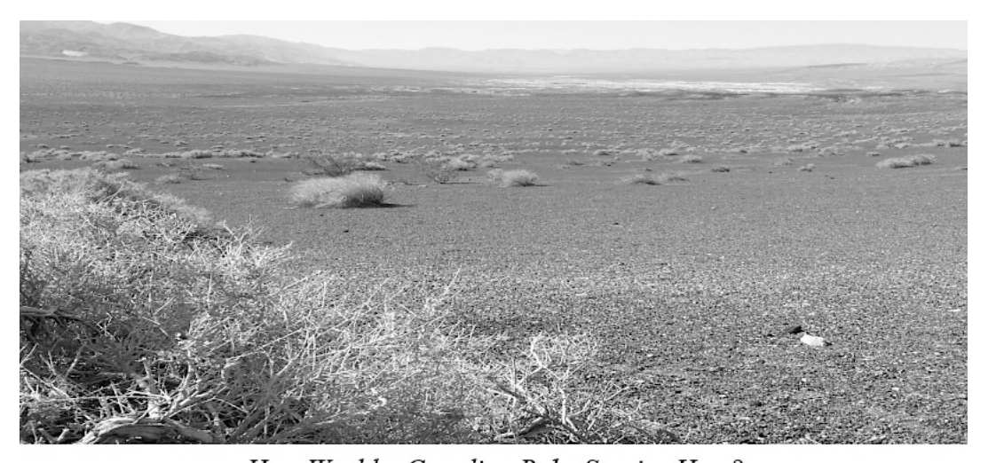
How Would a Crawling Baby Survive Here?

Let's take a look at this rarely detailed problem from another angle. Animals are not humans, they are different consciousness expression here on Earth, but it might be useful to examine the Animal Kingdom's Earth-Plane experience for a moment. In every BBC nature program, David Attenborough announces the word "survival" countless times. It would seem that, according to David, all animals are born onto the hellish place called Earth where the only thing they can hope for is the daily fight for survival at the beginning, followed by more daily fights for survival, followed by a random death at some point because they failed to survive. If an infant is born into that same realm, does it not stand to reason that they too have an innate concern over survival?